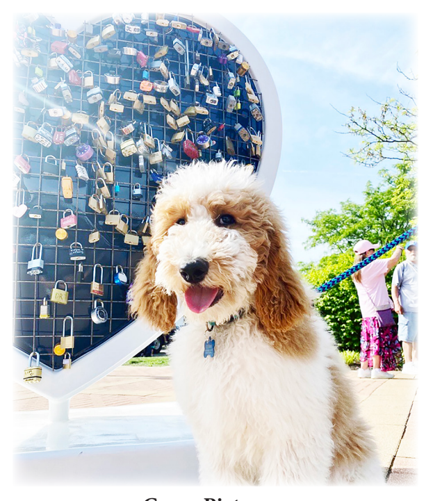
Cover Picture: Dogs leave paw prints forever on our hearts!