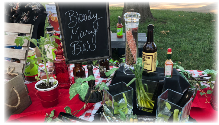
$25 ticket includes:

Wednesday, May 31 • 5:30pm - 7:30pm Shawnee Town 1929 • 11501 W. 57th Stroot