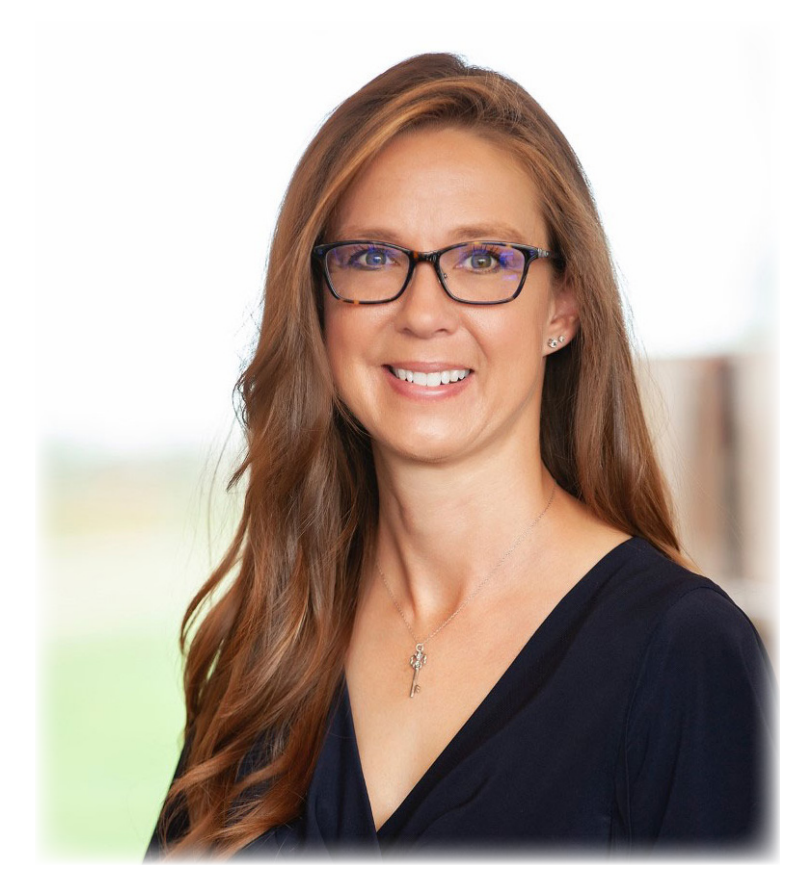
WORDS from the HEART